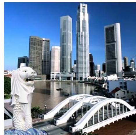
Singapore skyline with the well known Merlion in the forefront. Singapore will be the location for the 2010 World Congress

Street visited Singapore in July to inspect possible hotels for the 2010 World Congress. She reported that hotels were currently in the process of offering proposals. Dates for the congress have not been set yet, but it will be during the first half of November 2010 either immediately preceding or following the IFAC meeting.