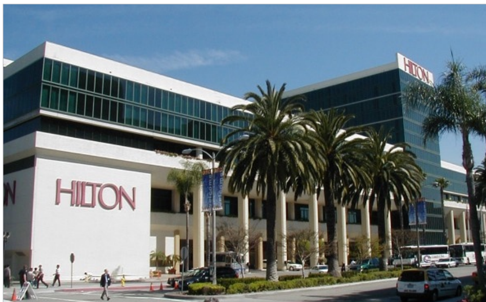
Anaheim Hilton Hotel, Anaheim, California, U.S.A.