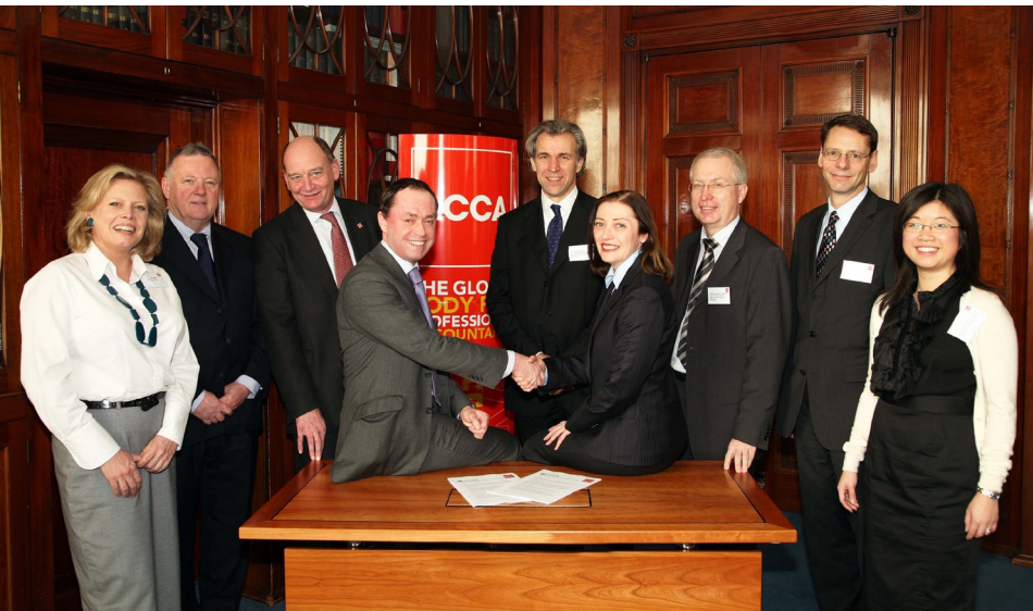
Members of ACCA and IAAER signing the official research agreement.

Two leading global bodies are to work together on high level research initiatives to contribute towards the debate on developing world-class standards of accounting practice and will be focusing on encouraging research in the emerging economies.